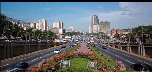
Weather conditions and environmental monitoring