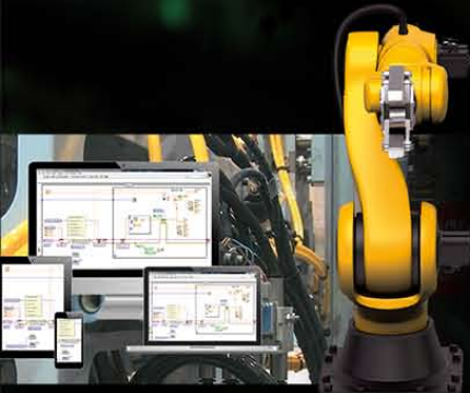
Production Data Acquisition and industry monitoring