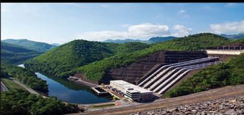
Water quality and pollution monitoring