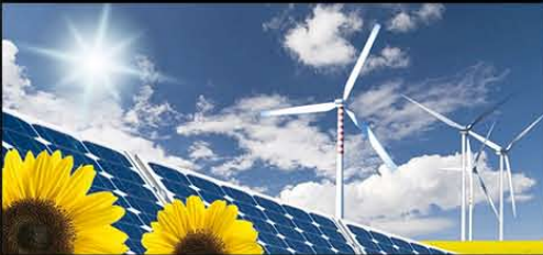
Smart energy management and monitoring